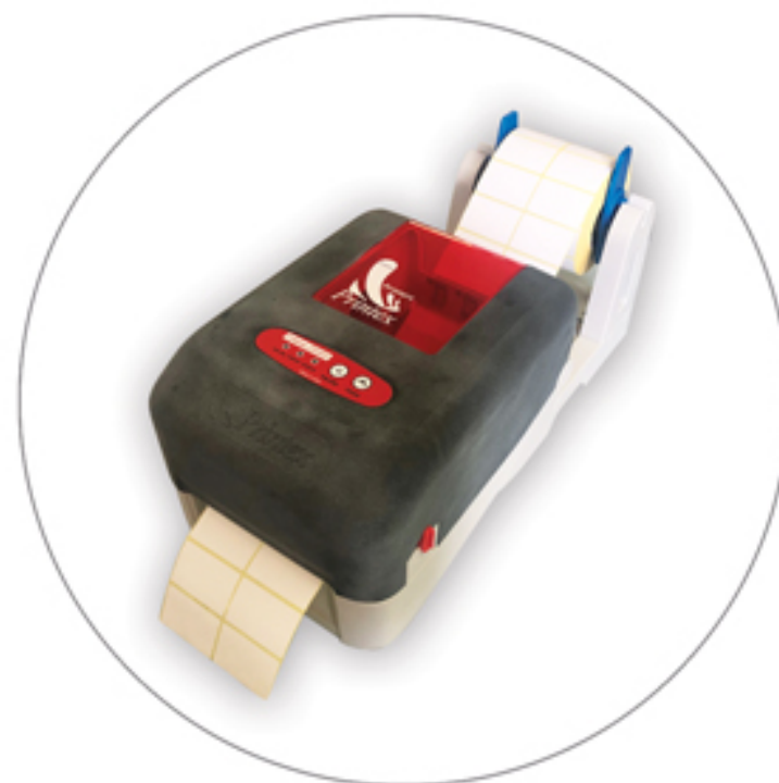
OPTIONAL: External roll holder suitable for big rolls