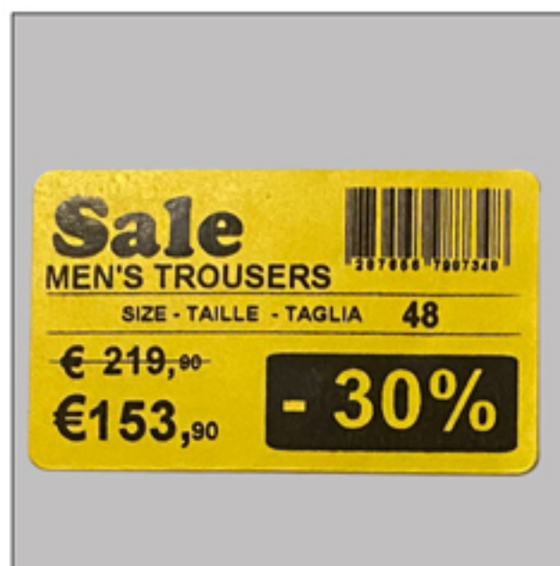
Adhesive Thermal / yellow Label Size: 50 mm X 30 mm