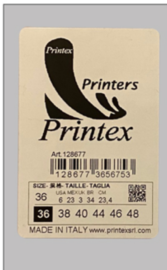
Adhesive Film OPP Label Size: 40 mm X 60 mm