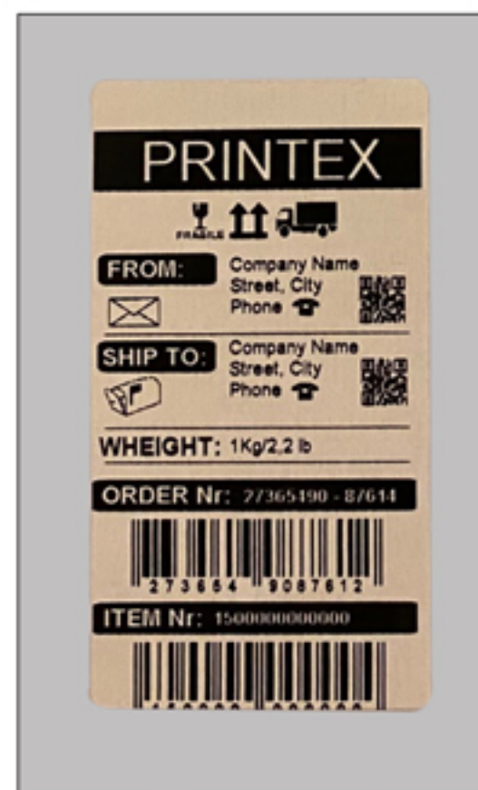
Adhesive Thermal Label Size: 33 mm X 60 mm