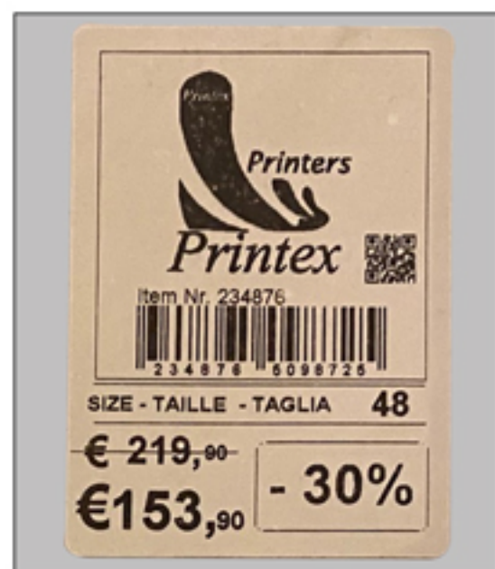
Adhesive Thermal Label Size: 37 mm X 52 mm