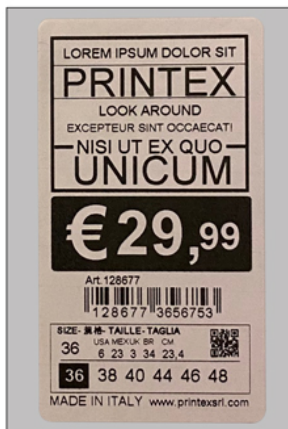
Adhesive Thermal Transfer Label Size: 40 mm X 72 mm