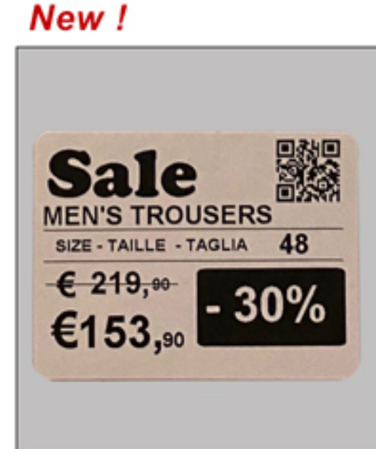
Adhesive Label TOP Size: 40 mm X 30 mm